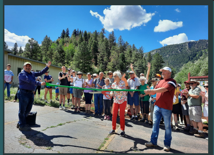
Red Butte Recreation Area grand opening, July