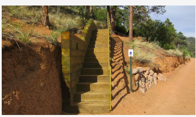
New trailhead steps and retaining wall, June