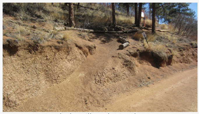
Eroded trailhead, March